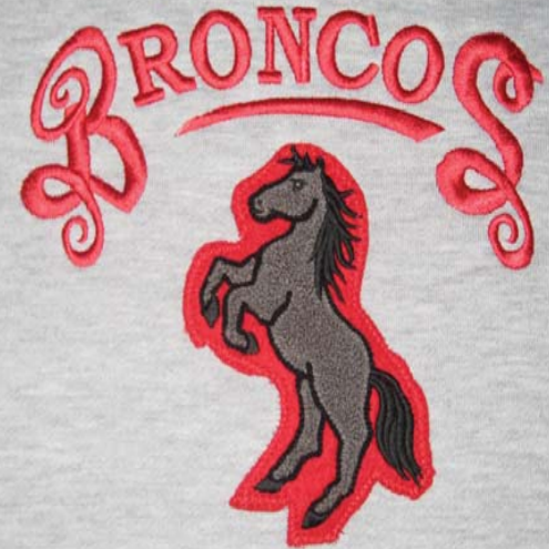
Full Front Design with Chenille Pony Applique / Embroidery