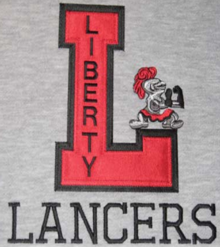
Full Front Design with Tackle Twill Applique Letter "L" / Embroidery