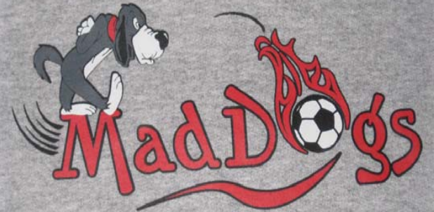
Full Front Youth Size / Silk Screen